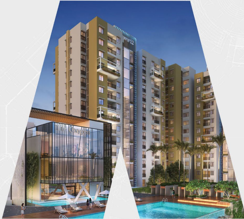
A PURAVANKARA HOME AT PURVA CELESTIAL